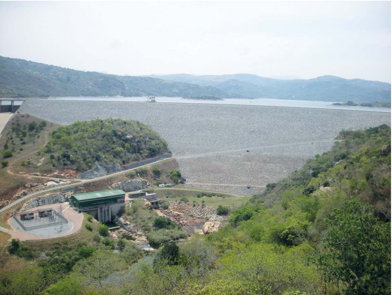
Photograph A for Question 5